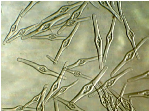
Figure 3. Ossicles of the tail of Molpadia musculus .

The ossicles of the tail are fusiform rods with three or four perforations in the centre (see Figure 3).