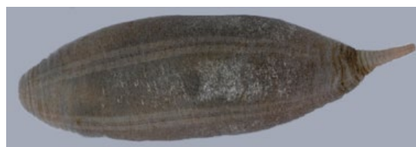
Figure 1. External view of Molpadia musculus .

The body of Molpadia musculus is barrel-shaped with a well-defined tail (see Figure 1). The specimens collected varied considerably in colour and size. Their body length was 43–70 mm, with a maximum diameter of 19–24 mm. The colour when placed in alcohol is light-grey to dark-brown. The skin is thick or thin, smooth or wrinkled. There are 10 simple tentacles.